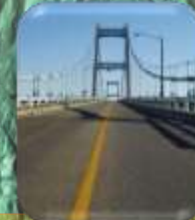
SEAWAY INTERNATIONAL BRIDGE Cornwall