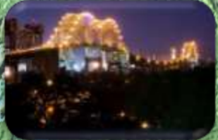
SAULT STE. MARIE INTERNATIONAL BRIDGE Sault Ste. Marie