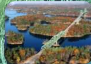
THOUSAND ISLANDS BRIDGE Lansdowne