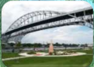
BLUE WATER BRIDGE Point Edward