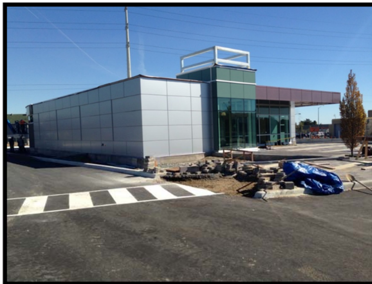
New Duty Free Shop at the Canadian Plaza in Sault Ste. Marie, Ontario.