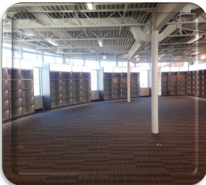
The new Duty Free Shop at the Canadian Plaza in Sault Ste. Marie, Ontario, opened to the public during the third quarter (left).