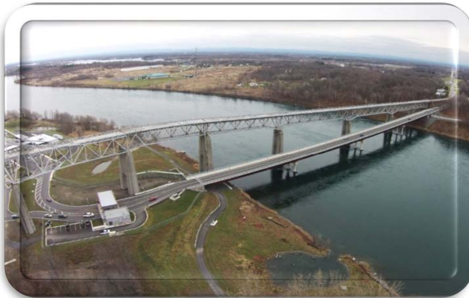
Aerial view of the old and the new North Channel bridges in Cornwall (late November) (top).

The employment levels at FBCL and its subsidiaries, SIBC and SMRBC, have remained stable. The only changes relate to seasonal hiring, which remain similar from year to year.