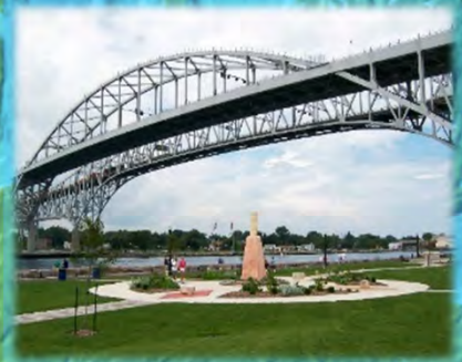
BLUE WATER BRIDGE POINT EDWARD