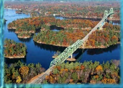
THOUSAND ISLANDS BRIDGE LANSDOWNE